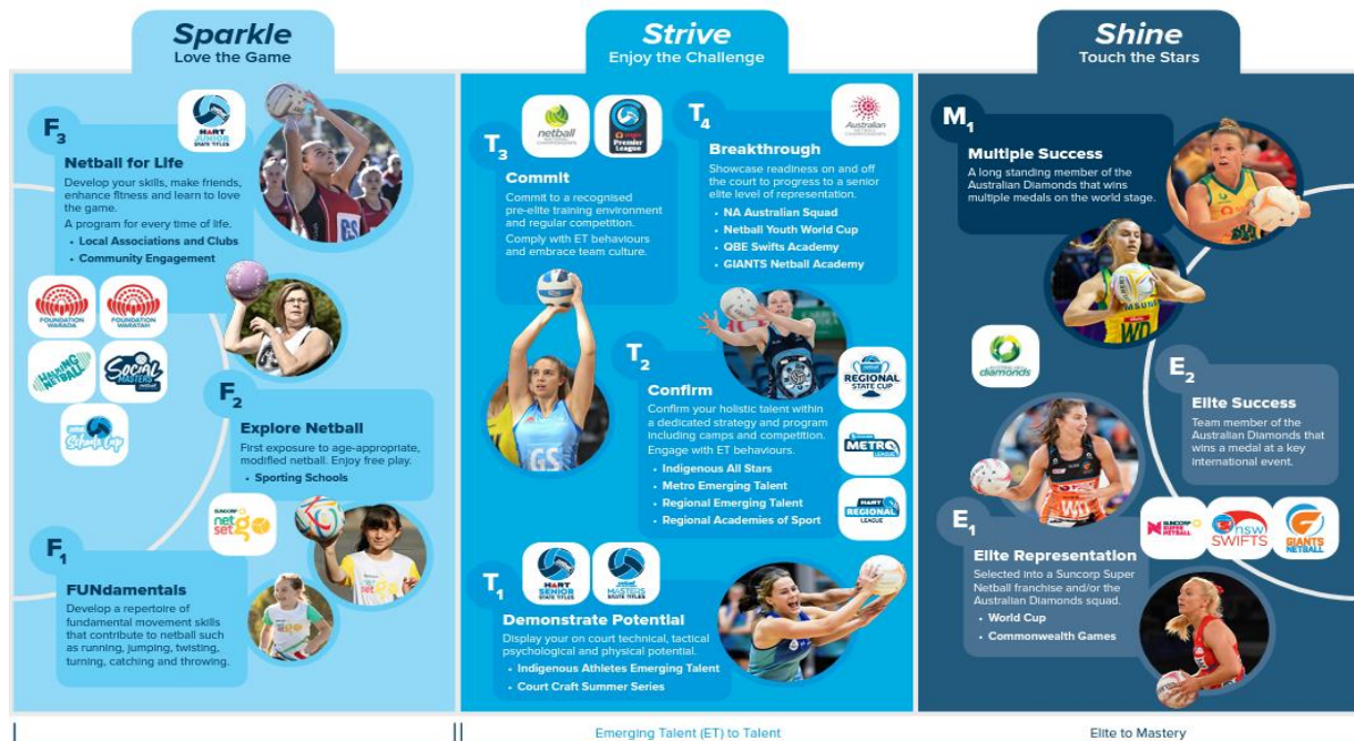
Foundation and Participation Pathways